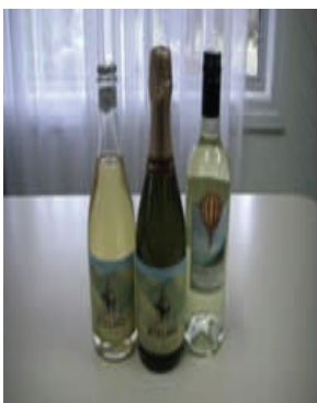
A great night was had by all who attended the wine dinner .