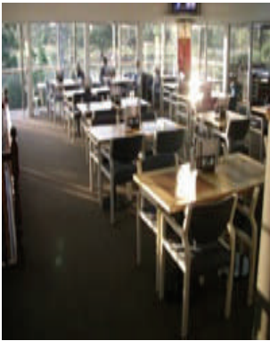
The newly laid carpet in the Bistro Area