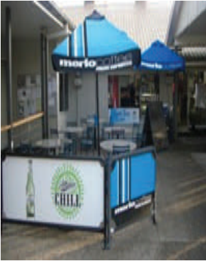
The New Café Area